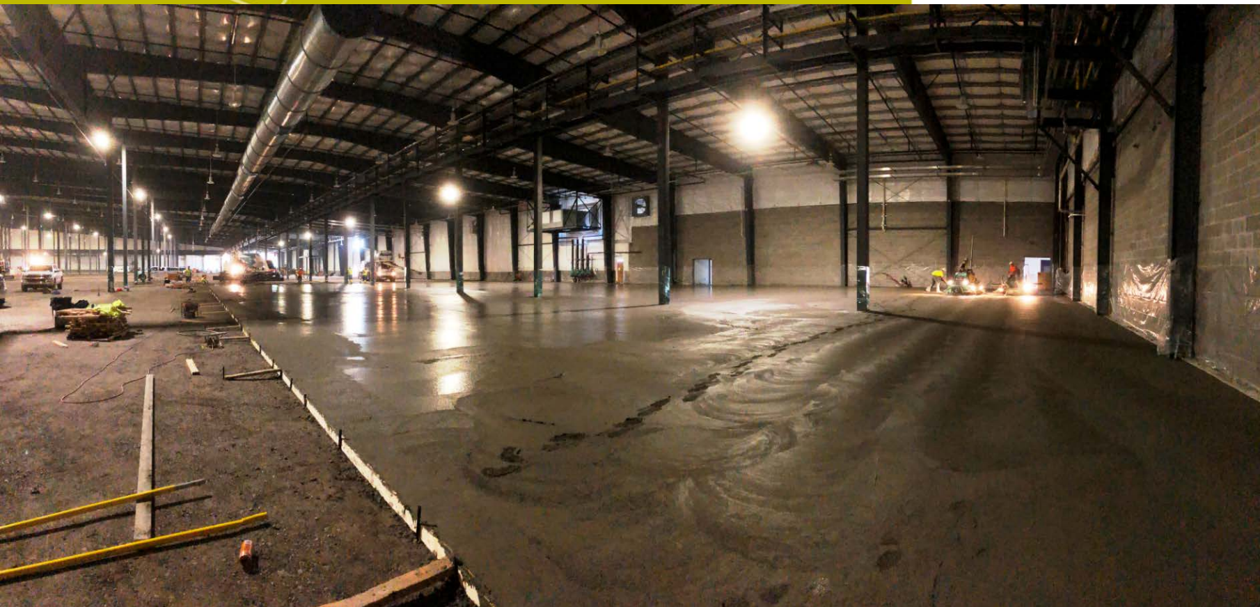
Concrete slab for main warehouse