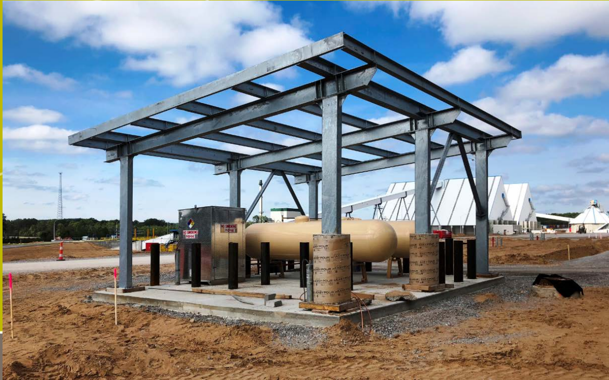
Propane fueling station nearing completion