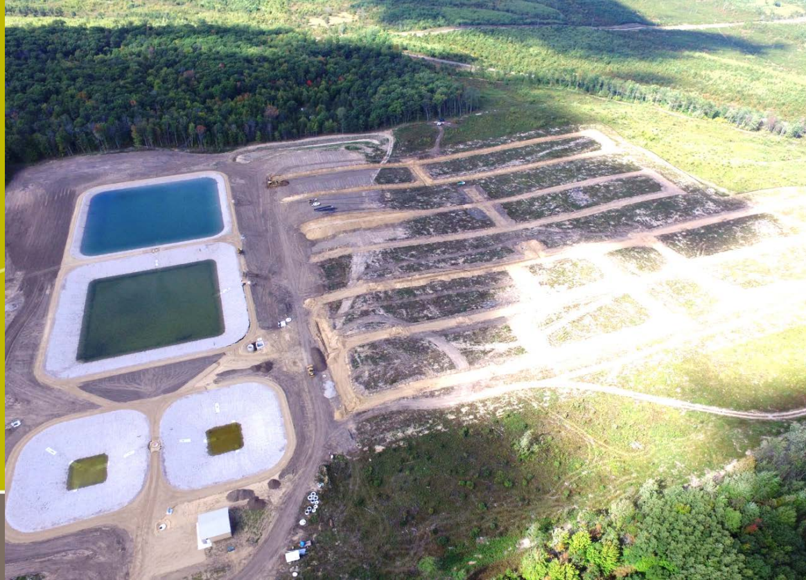
Waste water treatment facility