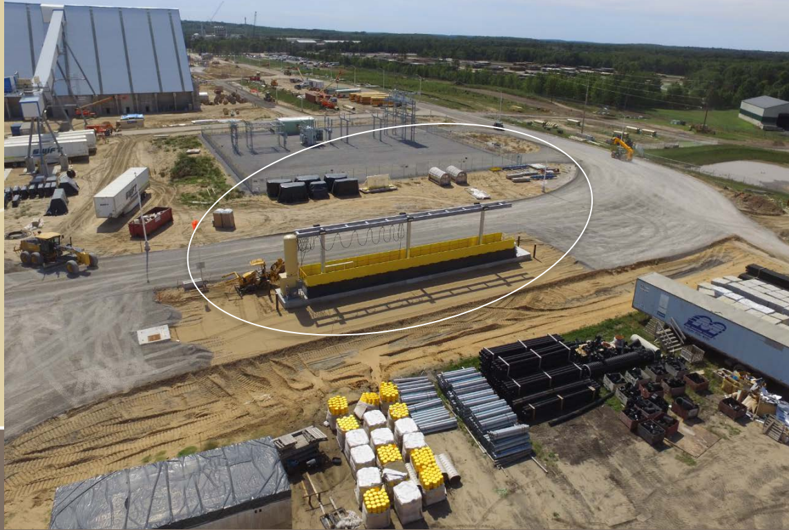
Log truck cleaning system