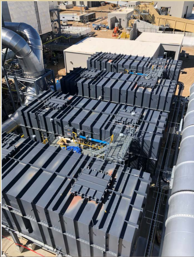
Top down view of RTO's (regenerative thermal oxidizers)